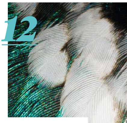
KO WAI A TAHITO (ABOUT TAHITO)